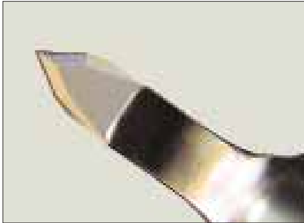
Figure 3. The Williamson trapezoid diamond keratome.

the manufacturing technique, stainless steel will not produce a blade as sharp as a diamond keratome.