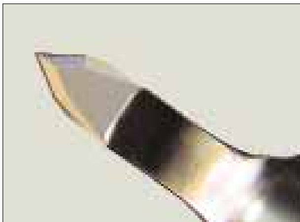
Figure 3. The Williamson trapezoid diamond keratome.

the manufacturing technique, stainless steel will not produce a blade as sharp as a diamond keratome.